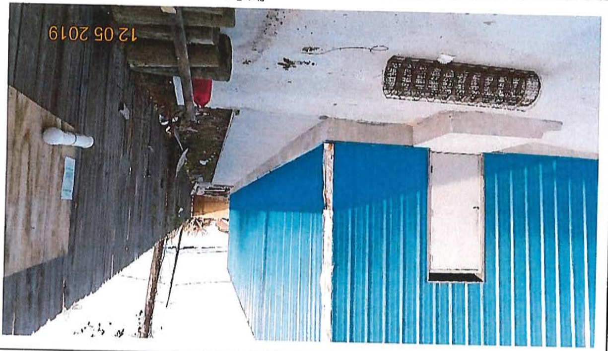
Photo Two Caption SIDE VIEW